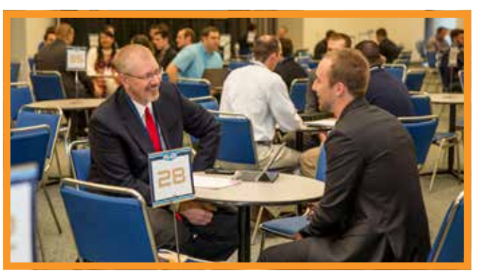
An employer interviews a job seeker at the 2014 PBEO Job Fair.