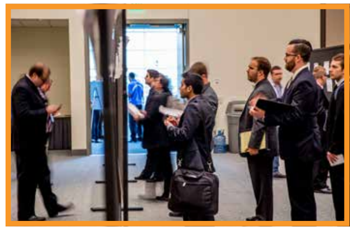
{\it Job seekers search\ through\ hundreds\ of\ jobs\ in\ the\ \it Job\ Posting\ Room}.

Walt Disney World Swan and Dolphin Resort Orlando, Florida December 10 – 13, 2017